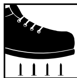
Product features reinforced midsole