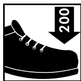
Product features 200J toe cap