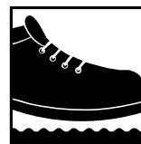
Product features anti-slip sole